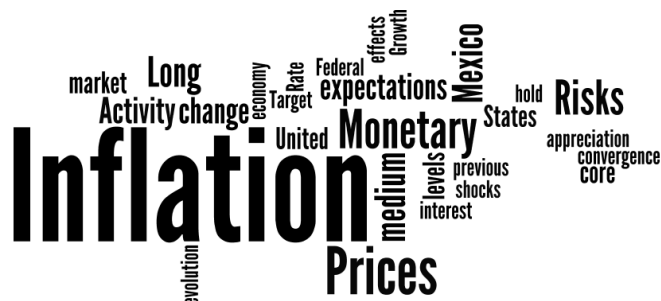
Word cloud of September statement