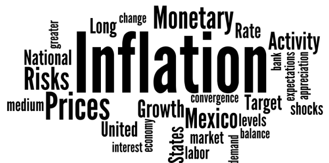
Word cloud of August statement