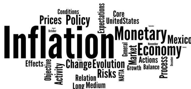
Word cloud of November's statement