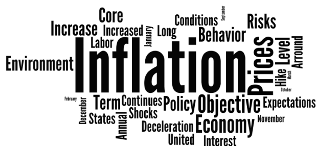
Word cloud of December's statement