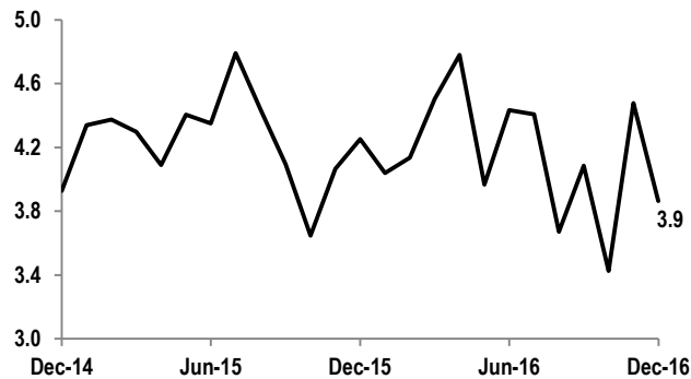
Contractual wage negotiations % yoy, nominal