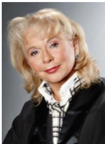
Olga María del Carmen Sánchez Cordero Proprietary Independent Member

She joined GFNorte's Board in April 2016.